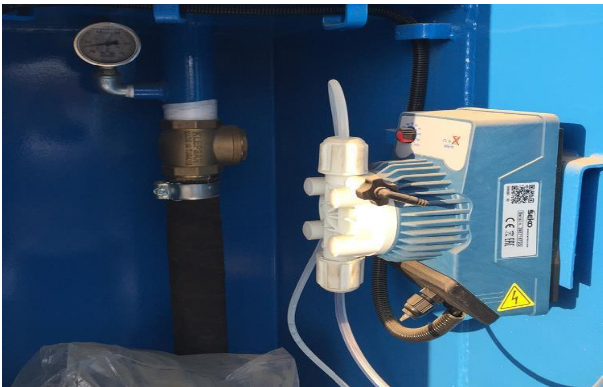
Discharge Water Chemical Dosing Unit Installation