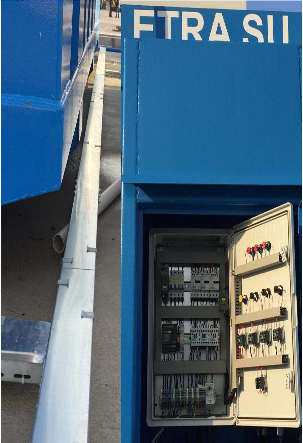
Electric Cable Tray, Cable and MCC/PLC Panel Installation