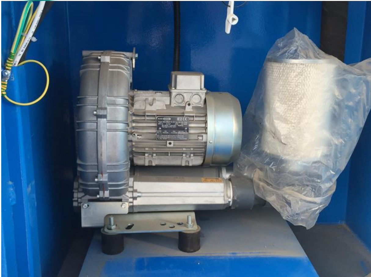
Reactor Blower Installation