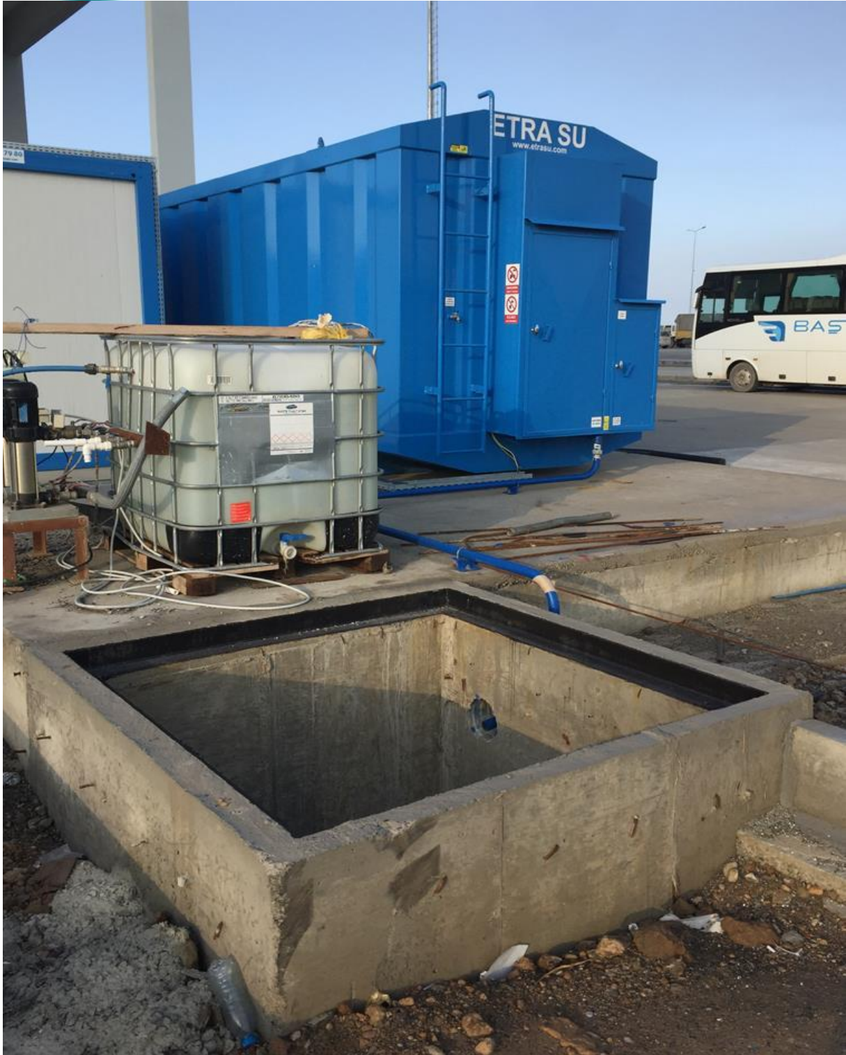
Discharge Manhole and Discharge Water Sampling Point