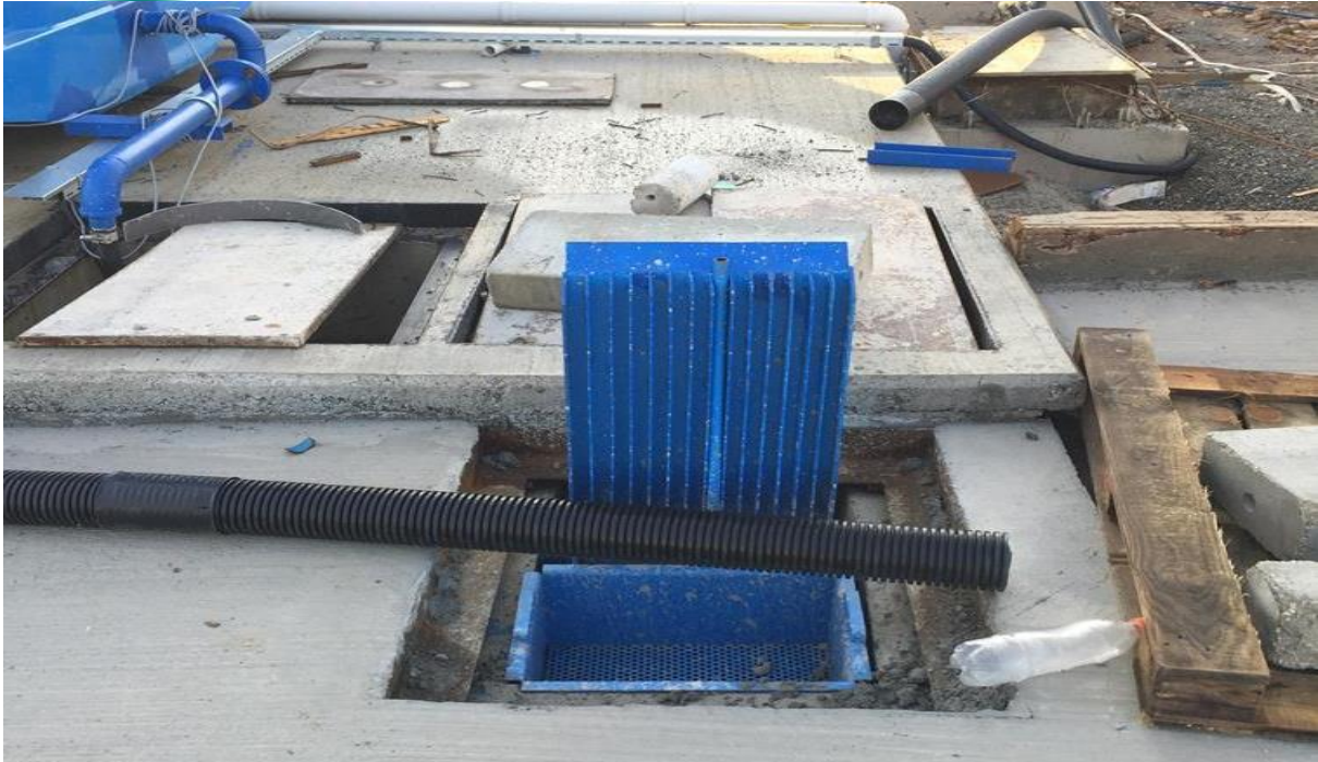
Coarse Grain Grid Installation