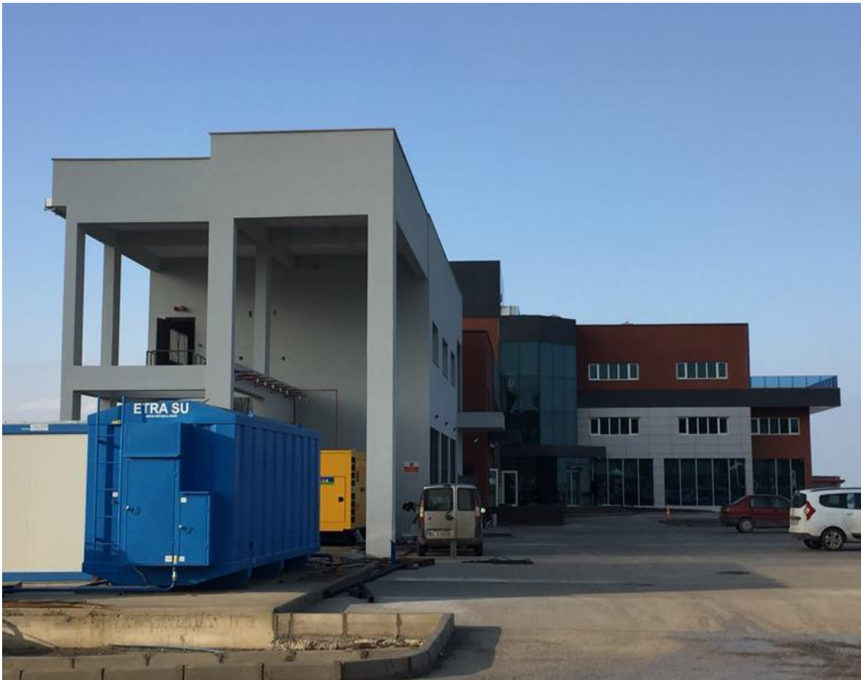
Biological Reactor Installation